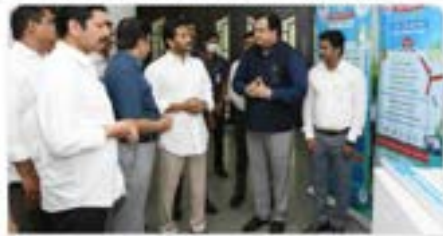
Andhra Pradesh: CM tells officials to expedite construction work in Jaganna Colonies. "Do an alternative scheme for water supply in Jaganna by August first week"

EESL India @EESL_India Andhra Pradesh Chief Minister Shri @ysjagan reviewed the progress of housing scheme & further inspected EESL's @EnergyEfficiency fans, @LED bulbs & tube lights which will be installed in the new houses being constructed in Jaganna Colonies. Read More: